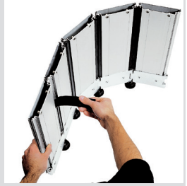
Integral rubber weatherseal