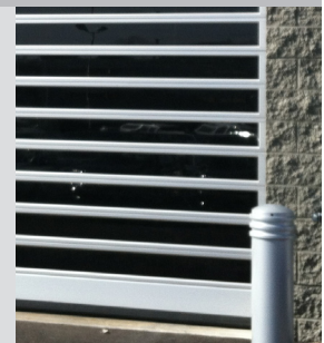
Grey tinted slats shown

*Side columns and head console; excludes some US/R models.