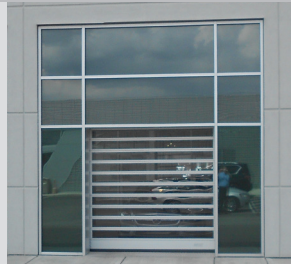
Nine-inch high vision slats for increased visibility