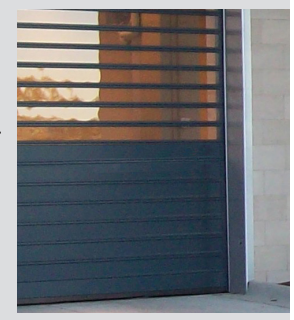
Optional vision slats shown

*Side columns and head console; excludes some US/R models.