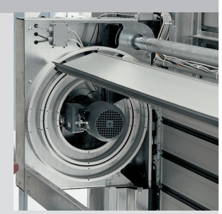
AC drive motor