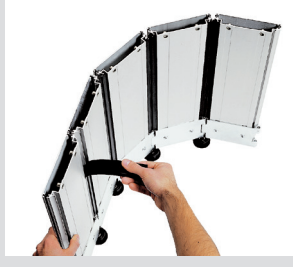
Integral rubber weatherseal