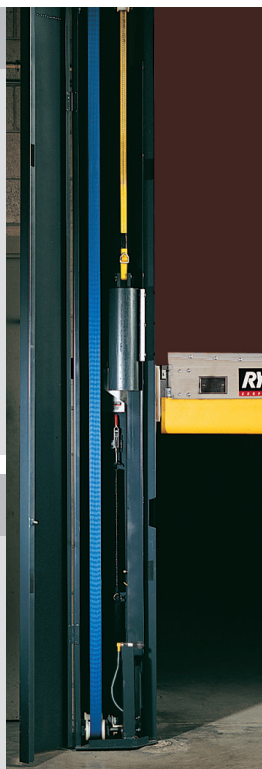
Side column with patented System II ®