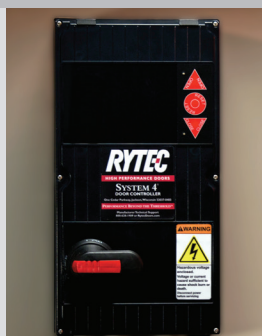
System 4 shown with optional rotary disconnect